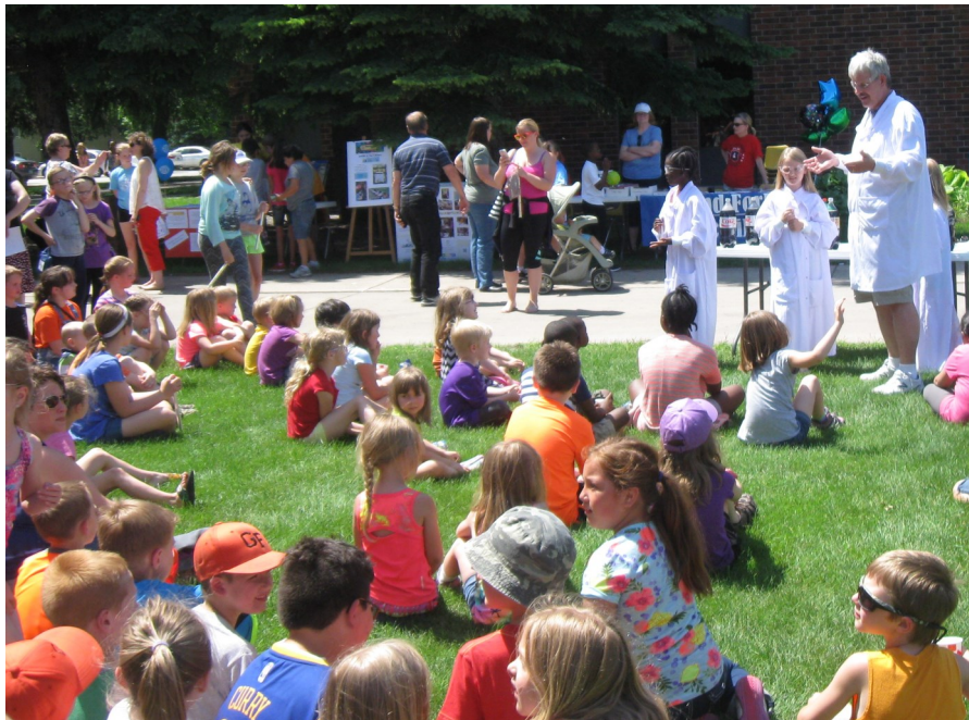
Summer Reading Program Kick-Off 2016